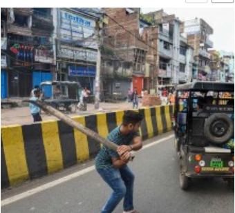
Bharat Bandh Observed By Farmers Amid T Security In Dehi