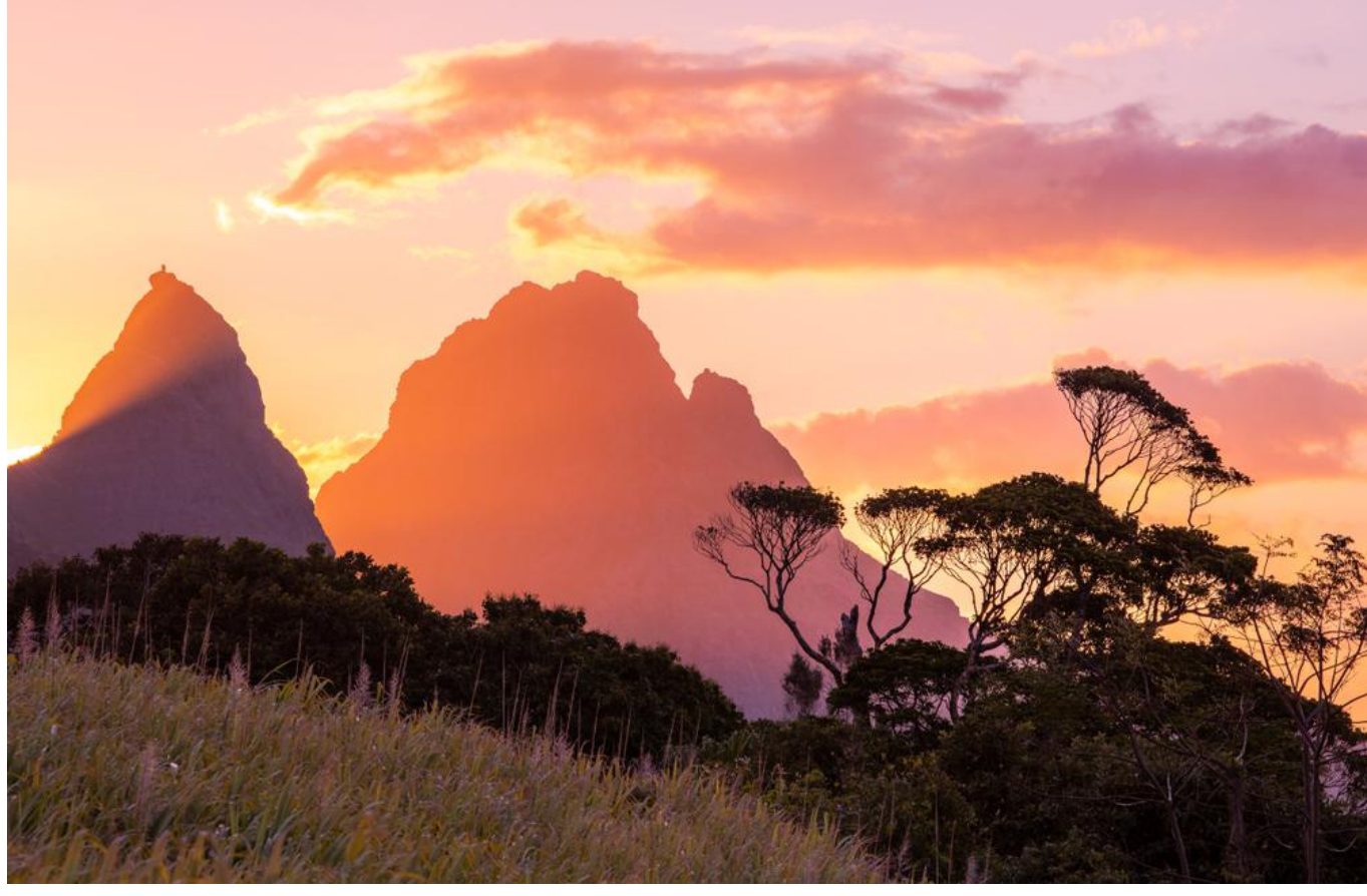
Mauritius in East Africa

Out of the ten countries with the largest volume growth, the biggest movers in terms of percentage were Mauritius , which saw an increase in flight bookings made in the KSA through all GDS of 219% during the last 12 months, and Russia, which registered a rise of 168%.