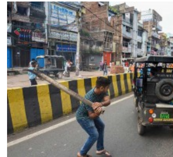
Bharat Bandh Observed By Farmers Amid T Security In Dehi