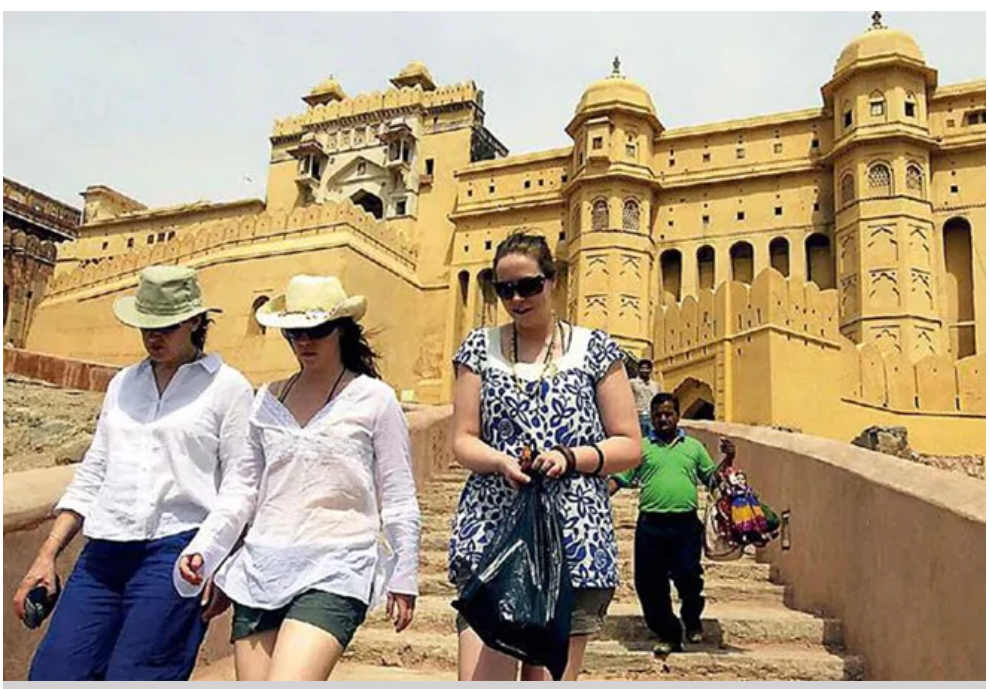
The travel and tourism industry is undergoing a radical shift due to pandemic imposed restrictions and is expected to have accrued a loss of Rs 90,000 crore.

Sandeep Dwivedi | February 1, 2021 | Updated 11:01 IST